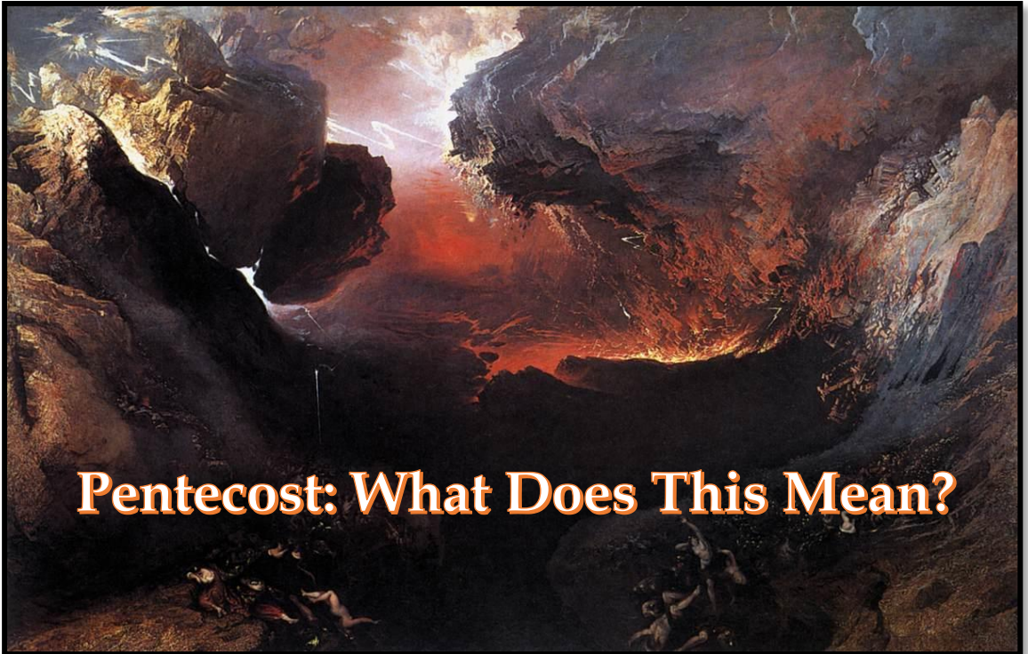
"The End of the World" by John Martin

17 “In the last days, God says, I will pour out my Spirit on all people. Your sons and daughters will prophesy, your young men will see visions, your old men will dream dreams. 18 Even on my servants, both men and women, I will pour out my Spirit in those days, and they will prophesy. 19 I will show wonders in the heavens above and signs on the earth below, blood and fire and billows of smoke. 20 The sun will be turned to darkness and the moon to blood before the coming of the great and glorious day of the Lord. 21 And everyone who calls on the name of the Lord will be saved.’